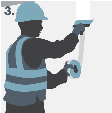
3. Embedding Knauf Aquapanel Exterior Joint Tape.