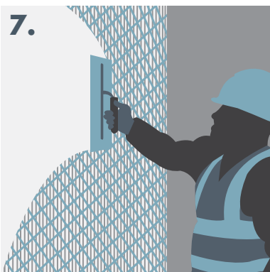
7. Covering mesh with basecoat.