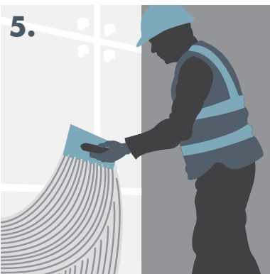
5. Applying notches within basecoat.