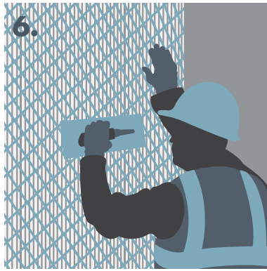
6. Applying reinforcing mesh.