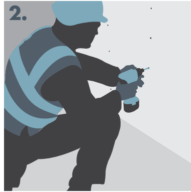
2. Fixing the boards to the background members.