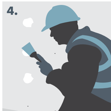
4. Covering screw heads with Knauf Aquapanel Exterior Joint Filler - Grey.