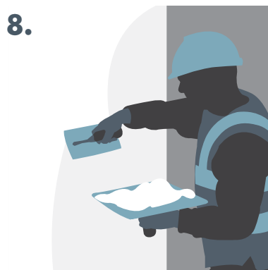
8. Applying finish.